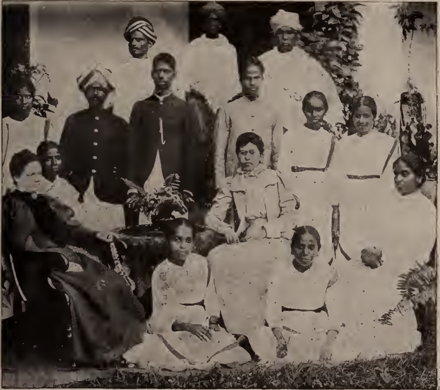
HOSPITAL STAFF OF THE GENERAL MEDICAL MISSION.

The American Board has among its missionaries 40 fully qualified physicians, and medical work is being carried on in 15 of its missions. It is estimated that more than 200,000 patients come annually under the treatment